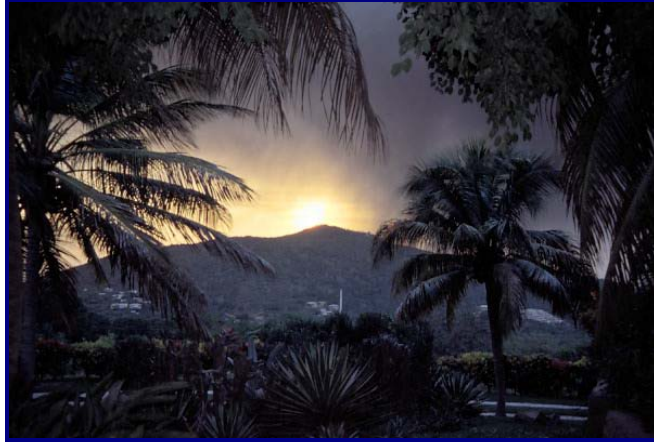
Sunset & Garibaldi Hill, Monseratt

DAY 3: Start your day with a swim before sailing to Nevis , an island jewel approximately 7 miles long and 5 miles wide, with natural vegetation that is unparalleled. From the top of the 3,232-foot Nevis Peak to the depths of the clear waters offshore, there is a world of flora and fauna to be explored. In the hills, the comical green vervet monkeys chatter and scamper. Visit the beautiful botanical gardens or the wedding site of Horatio Nelson .