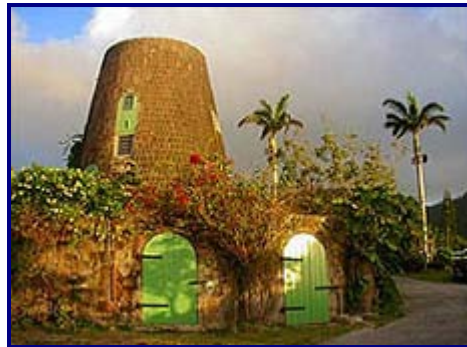
Converted Sugar Mill Suites, Nevis

DAY 3: Start your day with a swim before sailing to Nevis , an island jewel approximately 7 miles long and 5 miles wide, with natural vegetation that is unparalleled. From the top of the 3,232-foot Nevis Peak to the depths of the clear waters offshore, there is a world of flora and fauna to be explored. In the hills, the comical green vervet monkeys chatter and scamper. Visit the beautiful botanical gardens or the wedding site of Horatio Nelson .