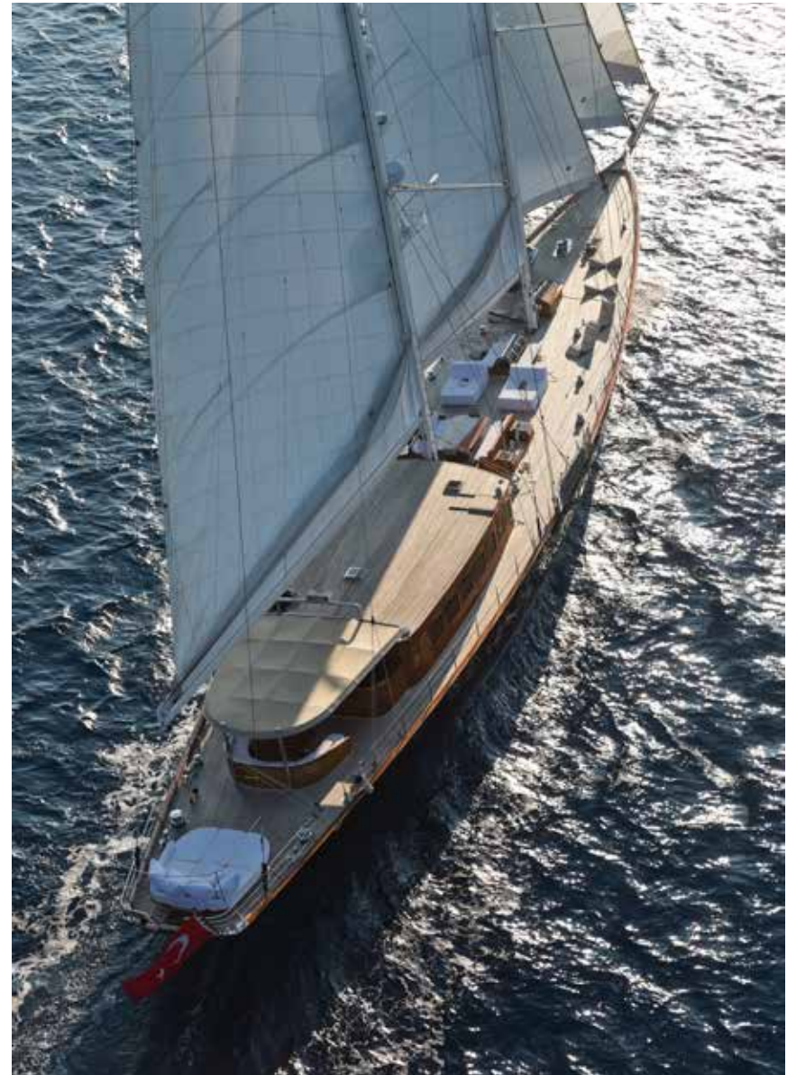
An Exclusive Yacht Cruise Experience with Sailing Charter On The Magnificent Super Yacht Regina.